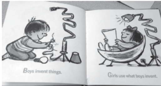
Figure 3: Boys are imaginative and creative whereas girls are docile and unimaginative

language game playing, and is actually one of the significant aspects in the pillar of socialization. For instance, in the poem "Girl," by Jamaica Kincaid – an Antiguan American Poet – the instructions below are advice given by an adult, probably the "Girl's" mother.